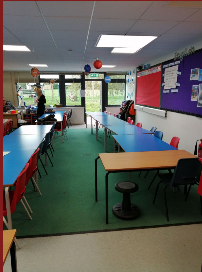
Larch Class (Year 5)