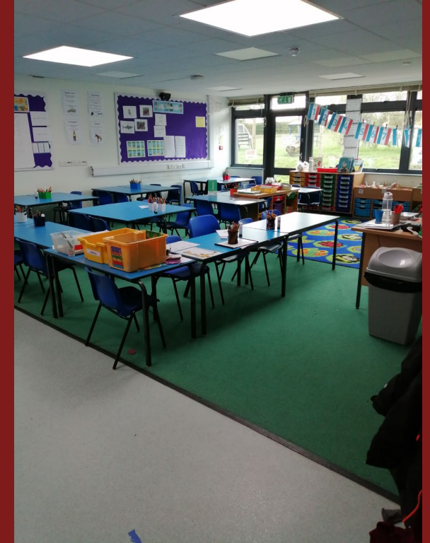
Cedar Class (Year 2)