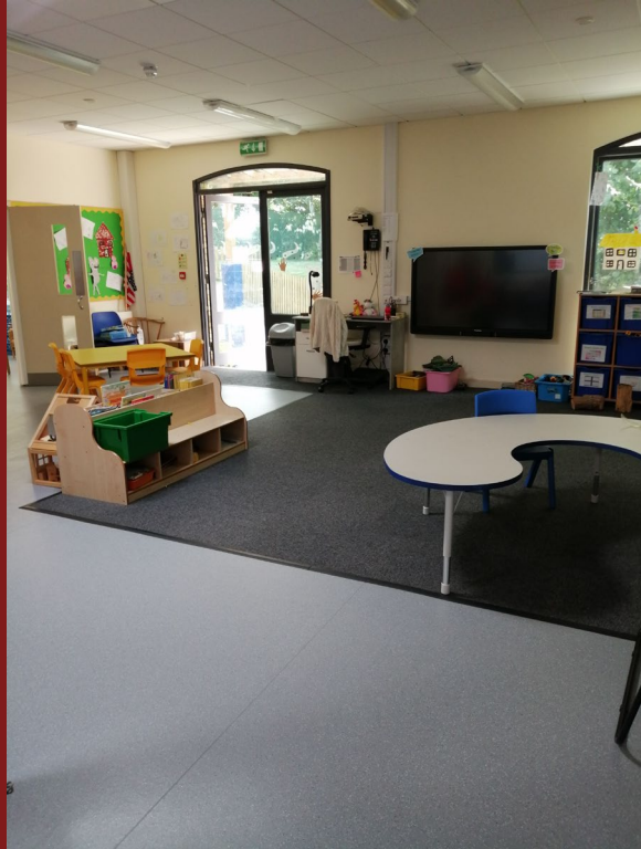
Beech Class (Year 1)