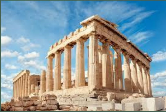
The physical and human geography of Greece.