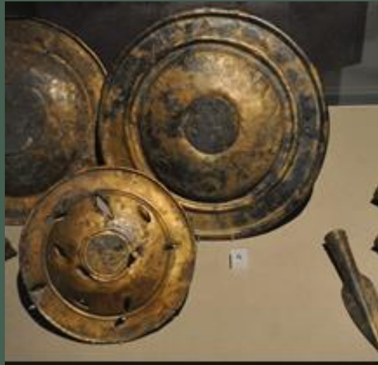
The Bronze Age and developing technology