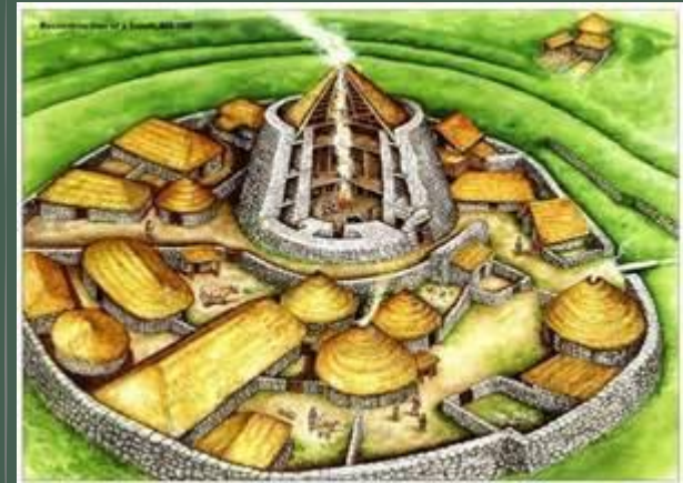
The Iron Age and Celtic settlements