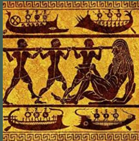
Gods and Goddesses and mythology.