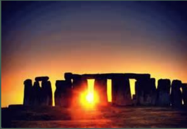
The Stone Age and Stonehenge